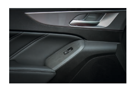
SLEEK BLACK INTERIOR.