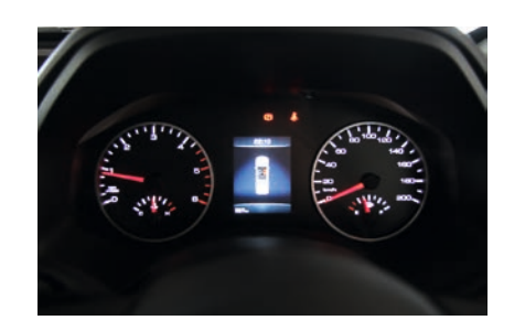
3.5 INCH COLOUR INSTRUMENT CLUSTER.