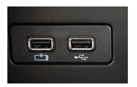
FRONT USB PORT.